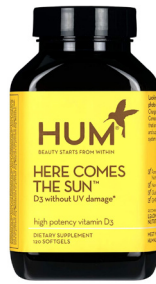
HUM® HERE COMES THE SUN VITAMIN D SUPPLEMENT