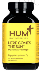
HUM® HERE COMES THE SUN VITAMIN D SUPPLEMENT $20