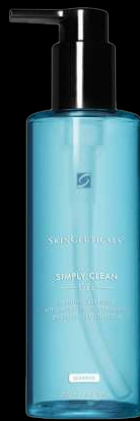
SKINCEUTICALS SIMPLY CLEAN CLEANSER $35